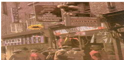
← This a picture of a few shops on Portobello road in 1966

The process of an area becoming wealthier and improving in quality is called gentrification, which is exactly what seems to be happening on Portobello road. This is linked to my hypothesis as becoming a wealthier and improving are signs of change. For example: