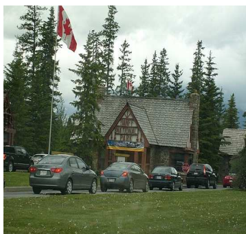
The above image shows tourist arriving at the canyon.

Over 6000 cars arrive in the park daily and this causes air pollution which can give problems to people with asthma. It can also cause traffic jams in the summer. A sustainable solution for this park and ride because it will decrease air pollution and by getting more people on a bus it will reduce the amount of cars arriving at the canyon park which will solve the issue of traffic jams.