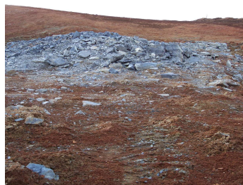
The above image shows rocks removed for souvenirs in the Grand Canyon.

They remove rocks for souvenirs. This has an impact on the Grand Canyon because it increases erosion when a stone is removed because it reaches the ground it exposing bedrock. A solution for this is to zone it.