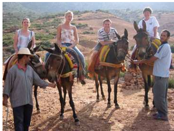
The above image shows tourists mule trekking.

They can also go mule trekking on the paths in the Grand Canyon. This means that the paths have to be blasted into the canyon sides and this is destroying habitats and looks ugly. Also by blasting into the canyon it causes an eyesore. A sustainable solution for this is to use natural paths instead of man made paths.