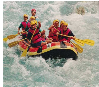
The above image shows tourists white water rafting.

Tourists can go White water rafting which brings thrills to the tourists but they leave litter and human waste in the river banks which can kill animals. Sustainable solutions to this to build a campsite like log cabins to prevent littering and if tourists continue to litter they can have their permits taken away.