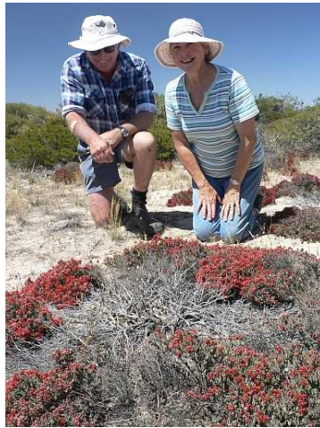
The above image shows tourists picking rare plants.

keeping with the environment to prevent tourists from picking the plants.