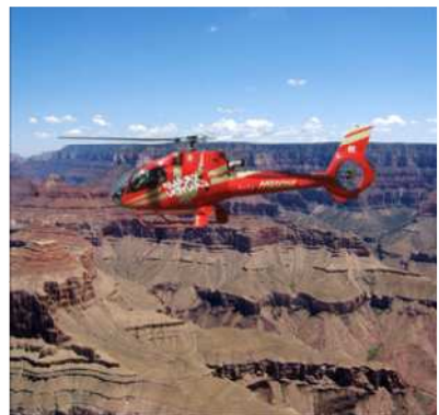
The above image shows a helicopter taking tourists down into the canyon.

Noise pollution from helicopters taking tourists down into the canyon destroys animals in their habitat. Also it contributes to global warming. A sustainable solution for this is that you have sound detectors near the park and residential areas.