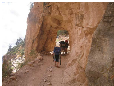
The above image shows the popular trail 'Angel Trail'.

Footpath erosion as most tourists use the same trails this looks ugly and destroys plants. The most popular trail is the Angel trail. A sustainable solution for this is to only allow a minimum amount of people to go through certain paths. Or you can plan new routes for tourists to go through, put signposted routes, or have artificial surfaces laid.