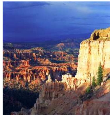
The above image shows one of the view points in the Grand Canyon.

Tourists can go to the edge of the paths to view points. This has an impact on the Grand Canyon because severe erosion is taking place at popular view points making the canyon edge unstable. A solution for this is to allow a minimum amount of people at the view point so erosion doesn't take place or stop them from viewing it and create a different view point.