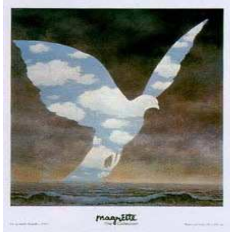
La Grande Famille (1963)