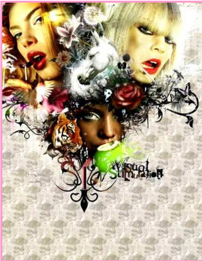
Image (a) was designed in 2004 for web-design and illustrative magazines. This image is based on photographic images collaged together with illustrative designs that have been added later on Photoshop. The forms used in the image are all natural objects and animals, giving the sense of natural beauty to such a modern and developed piece of art.